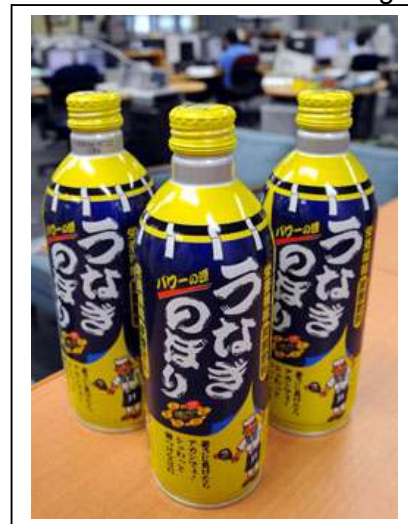
"Surging Eel" Energy Drink